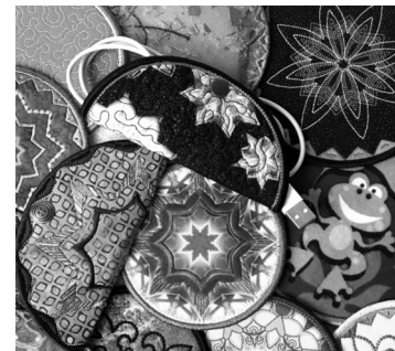
RIC – Running In Circles Embroidery CD