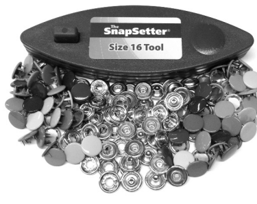
81162T – Snap Collection from the Snap Source