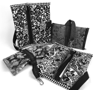
#731 – Cell Phone Wallet Pattern